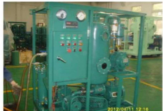
ON-LINE TRANSFORMER OIL DEGASSIFIER