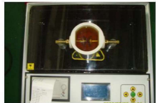
Automatic Oil Dielectric Breakdown Voltage Tester