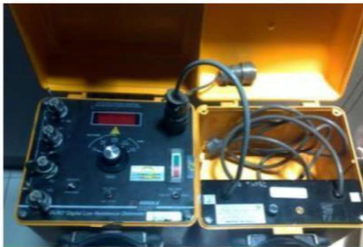
DIGITAL LOW RESISTANCE OHMMETER