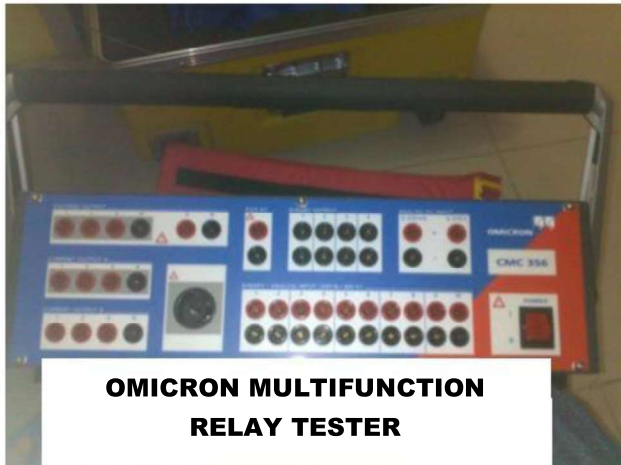
OMICRON MULTIFUNCTION RELAY TESTER