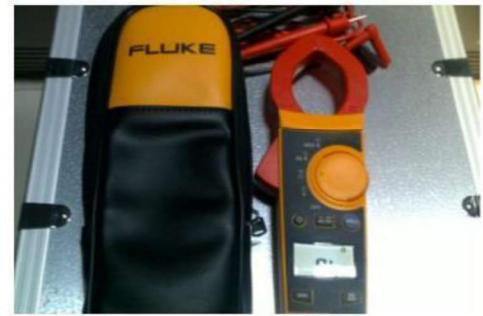
400Amp AC/DC Ammeter w/ VOM