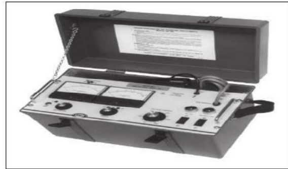
15KV Insulation Resistance Megaohmmeter