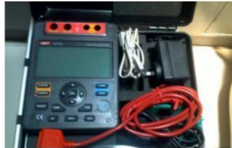
INSULATION RESISTANCE OHMMETER