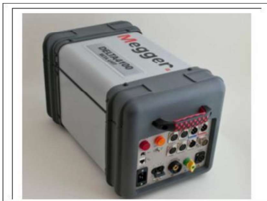
DELTA 4000 POWER FACTOR TESTER