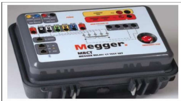
MRCT Automatic CT Tester